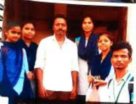
Visakhapatnam, Andhra Pradesh P72X+FHC, Jalaripeta, Port Area, Visakhapatnam, Andhra Pradesh 5 Lat 17.701186° Long 83.298853° 16/09/22 03:20 PM GMT +05:30