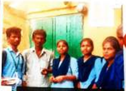
Visakhapatnam, Andhra Pradesh 21-42-1/2, Punjabi Hotel Rd, Chengal P Area, Visakhapatnam, Andhra Pradesh Lat 17.701179° Long 83.298526° 16/09/22 03:33 PM GMT +05:30