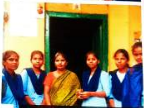
Visakhapatnam, Andhra Pradesh P72X+CFJ, Punjabi Hotel Rd, Burujupeta, Rao Peta, Port Area, Visakhapatnam, And 530001, India Lat 17.701088° Long 83.298575° 16/09/22 03:35 PM GMT +05:30